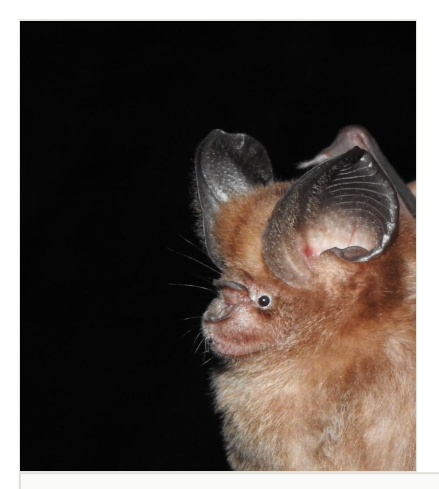
Figure 7. A Large Eared Roundleaf Bat individual.