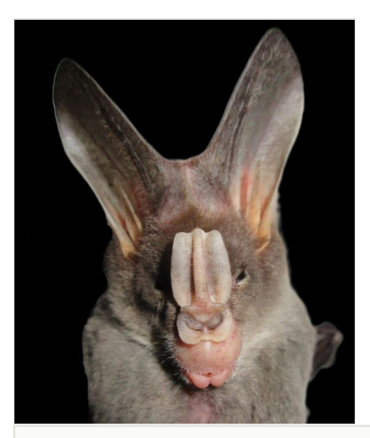
Figure 4. A Greater False Vampire Bat individual.