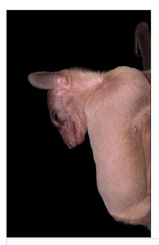
Figure 3. A Leschenault's Rousette individual sampled in this study.