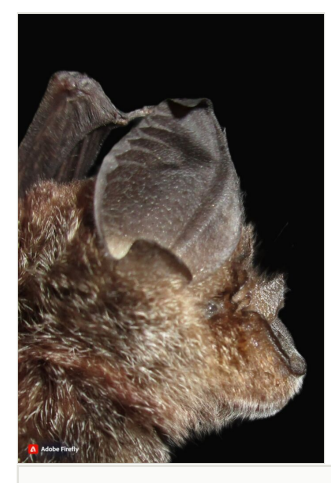
Figure 6. A Croslet Horseshoe Bat individual captured in this study.