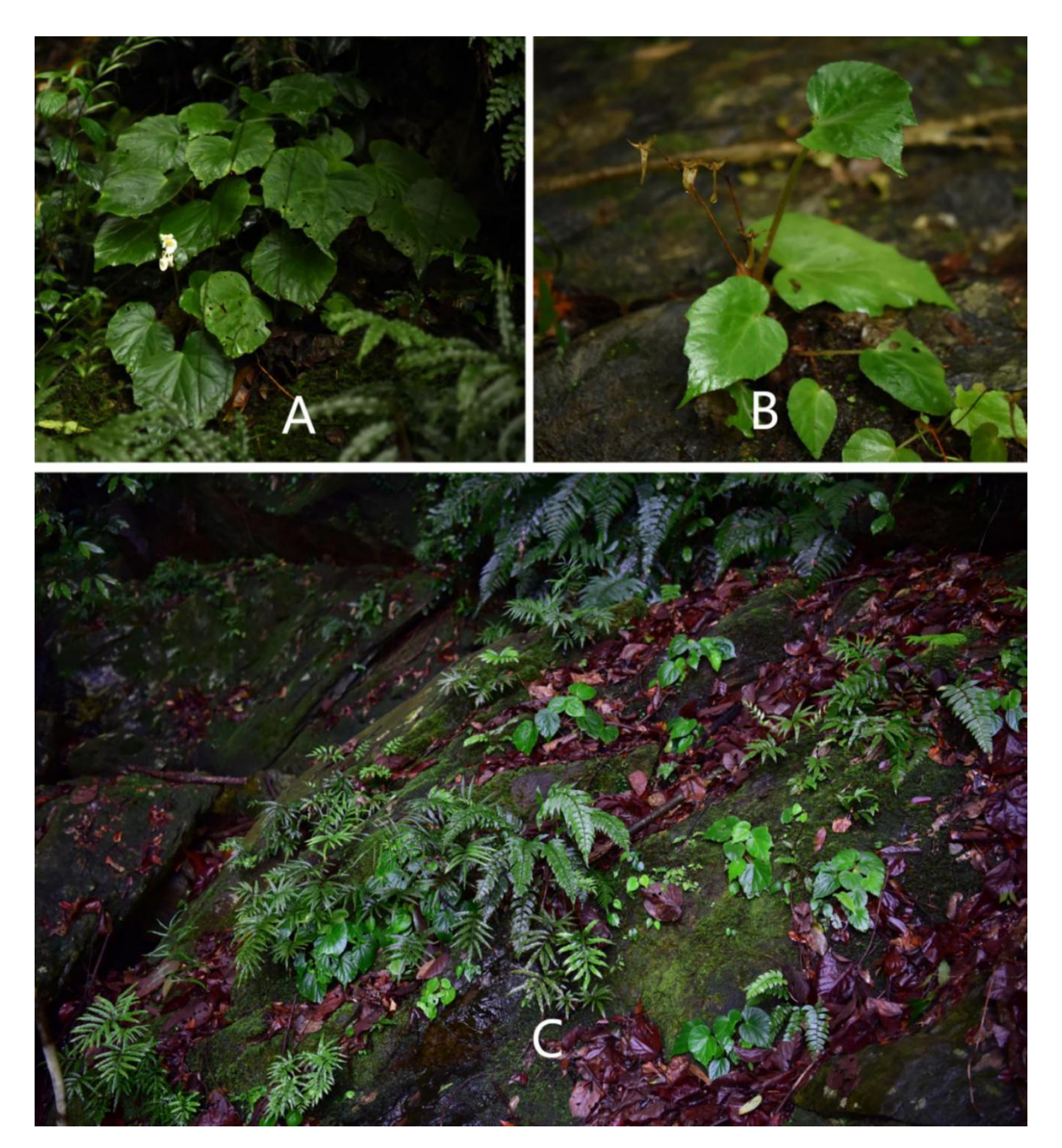
Figure 1 Plants and habitat of B. shenzhenensis D.K.Tian & Xiao-Yun Wang A. Plant at the earliest flowering time (6 June, 2020); B. Plants with the dried fruits matured in the previous year; C. Habitat showing mature plants and seedlings of the new species growing together with mosses and ferns above the rocks.