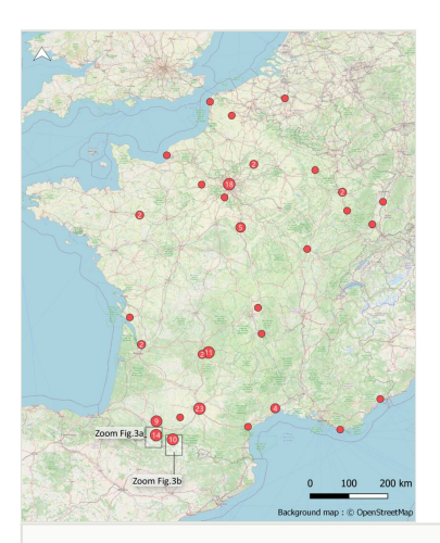
Figure 1. Spatial location of the 122 occurrences having data associated with coordinates.