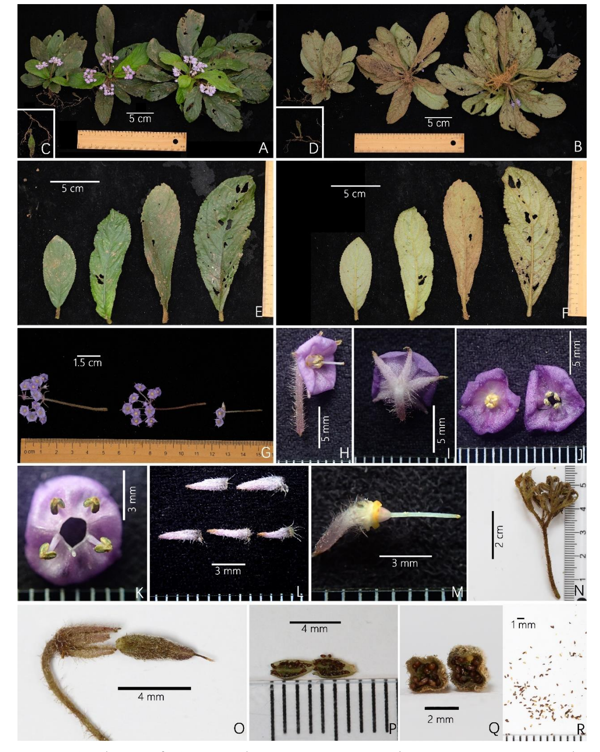
Figure 4. Photos of Actinostephanus F.Wen, Y.G.Wei & L.F.Fu gen. nov., the individuals in natural habitat. A. enpingensis F.Wen, Y.G.Wei & Z.B.Xin sp. nov. A top view of plant B upward view of plant for showing root system C top view of bud at the end of root D upward view of bud at the end of root E adaxial surfaces of leaves F abaxial surfaces of leaves G cymes H lateral view of flower I posterior view of flower J frontal view of corolla K stamens and staminodes L abaxial surfaces of capsule Q cross-section of capsule R seeds