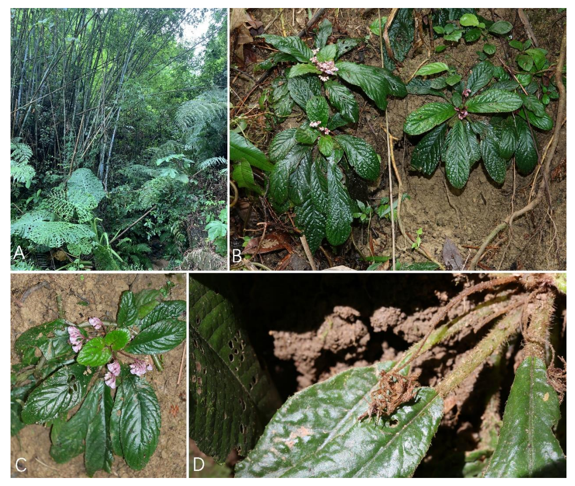
Figure 3 . Photos of Actinostephanus F.Wen, Y.G.Wei & L.F.Fu gen. nov. ( A. enpingensis F.Wen, Y.G.Wei & Z.B.Xin sp. nov.), the individuals in natural habitat. A habitat B habit C plant in flowering D plant in fruiting