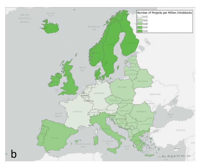
Figure 2 : Geographic distribution of projects: a number of projects per country and b number of projects per region, per million inhabitants.