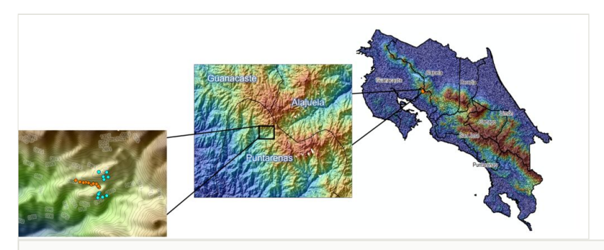
Figure 1. Study areas in the Monteverde region in Costa Rica. Blue dots indicate forest trapping sites, while orange dots indicate open area trapping sites