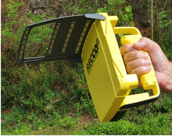
Figure 4. RECCO hand-held harmonic radar transceiver.